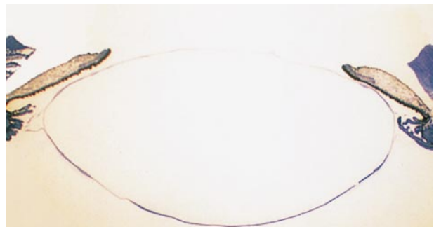
Figure 2. Histopathological section of a refilled lens capsule from the monkey eye shown in Figure 1, 6 months after surgery. The section was cut horizontally from the middle of the resected specimen. Note the lens epithelial cells that migrated onto the posterior capsule (toluidine blue, original magnification \times 9 ).

application ranged from -6.75 to -13.25 D. Postoperative refractions before pilocarpine application ranged from +5.0 to +8.5 D, and those 1 hour after application ranged from +0.5 to +7.0 D. Accordingly, the preoperative accommodation amplitude ranged from 5.75 to 11.25 D with a mean ( \pm SD) of 8.0 \pm 2.0 D, while the postoperative accommodation amplitude ranged from 1 to 4.5 D with a mean of 2.3 \pm 1.3 D (Table).